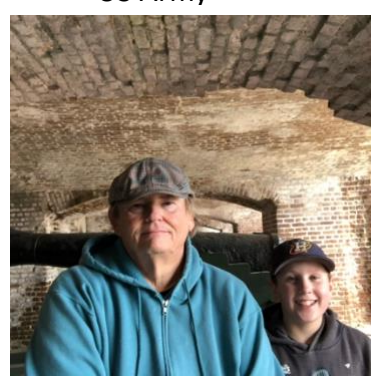
Author & Lincoln in Gun Emplacements Fort Sumter