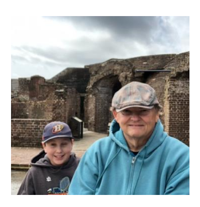
Author & Lincoln Fort Sumter