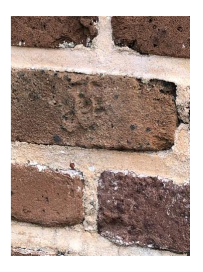
A Child's Handprint Fort Sumter

As far as Fort Sumter goes, the first thing needing construction was an island for it to sit on. Laborers, including slaves, built the land up so the new fort's guns could command the sea approach to Charleston. The wind and waves proved formidable obstacles for 1820's construction practices, but the workers got the island built.