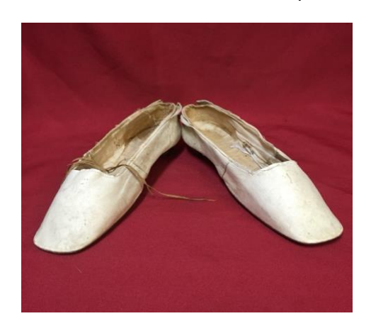
19<sup>th</sup> Century Dancing Shoes