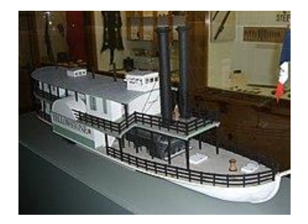
Steamship Yellow Stone

In Galveston, Houston was again denied passage on a steamer. He boarded the sailing vessel, Flora , and wallowed in the Gulf for a week with his fever rising every day. Steamboats made the journey in two days.